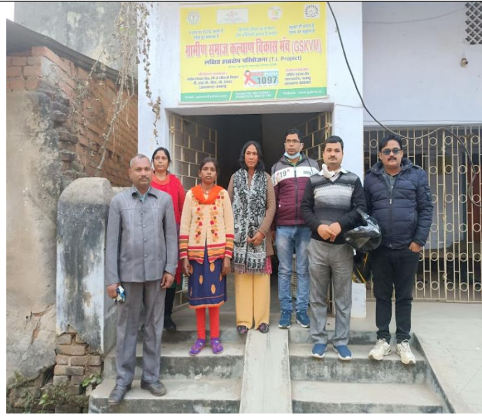
ICTC Counselor, ART Pharmacists and TI Team at Deoghar Office