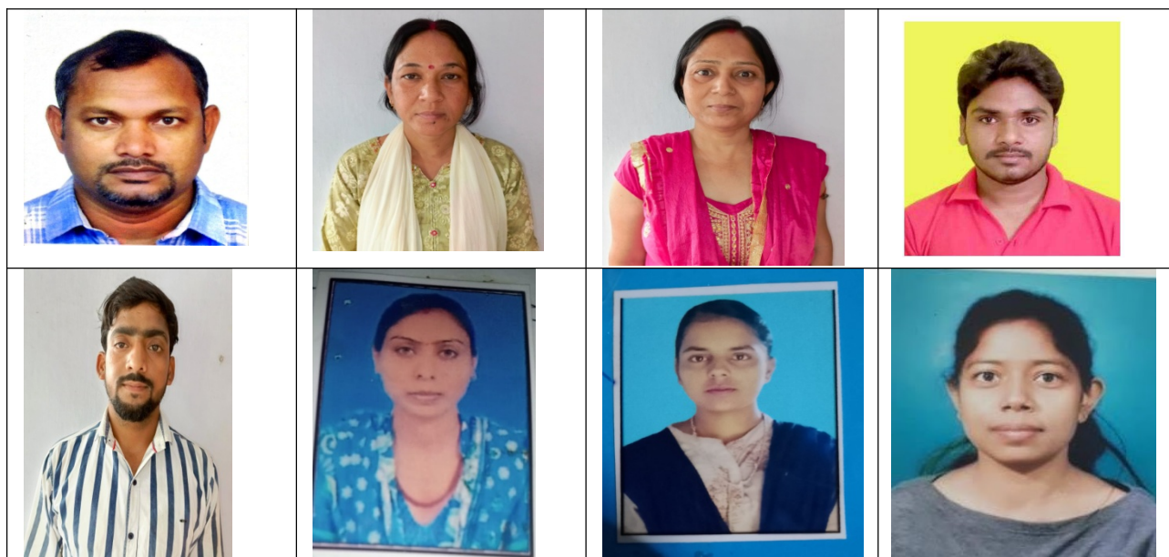
Project Director, Project Manager, Counselor, M&E Cum Accountant and Out Reach Workers